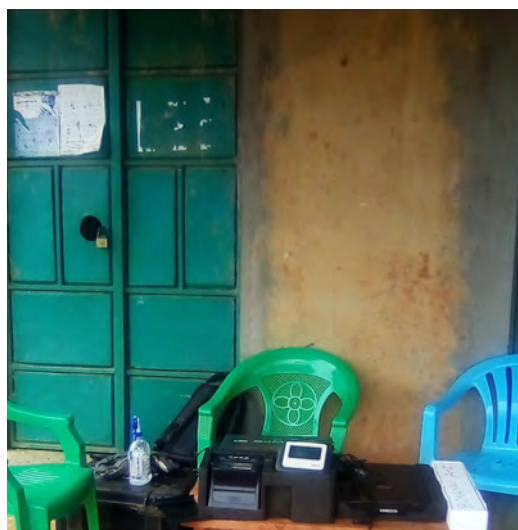
Figure 26. An unattended National ID collection point in Namayingo, where residents had been waiting for three hours to pick up their card.

Third, NIRA appears to have been 'distracted' by other public and private service demands to properly facilitate the integration of Ndaga Muntu . This includes the SIM registration exercise, the Pension Payroll Verification, and the Learner's Project. The Auditor General's report on NIRA found that: