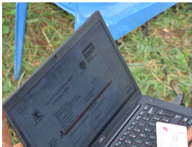
Figure 14. A SCG enrolment form and national ID being checked.

The officials had to take fingerprints from a dead body so as to release the money that was due to him.