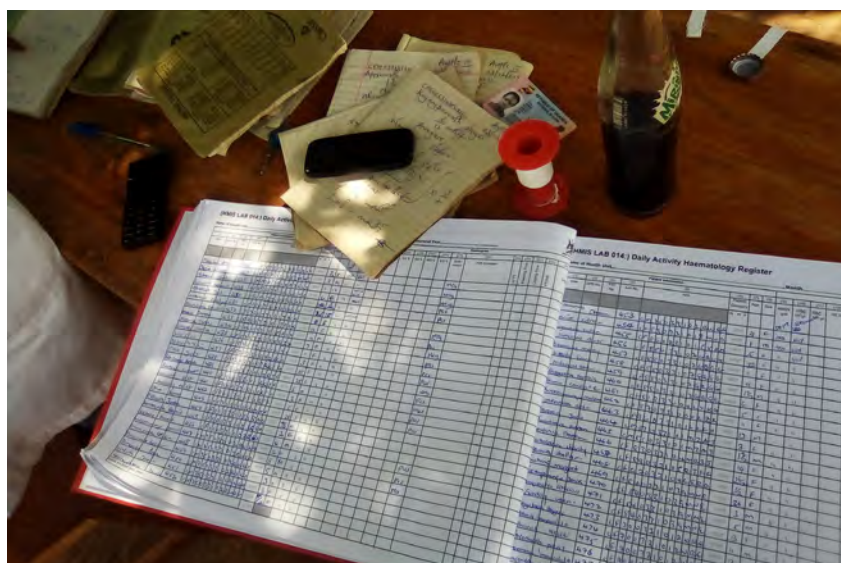
Figure 20. A patient register with columns for the NIN.

Many health workers we spoke with did identify some benefits to writing down their patients' NIN and basic biographical and health information. Mainly, they believed that this made it easier to identify individual patients and to follow up with them about treatments. However, many health workers also said that while it was a requirement to ask for an NIC and register the NIN, they often did not enforce it because it meant that they would have to deny care to patients in need—and because they feared reprisals from angry community members.