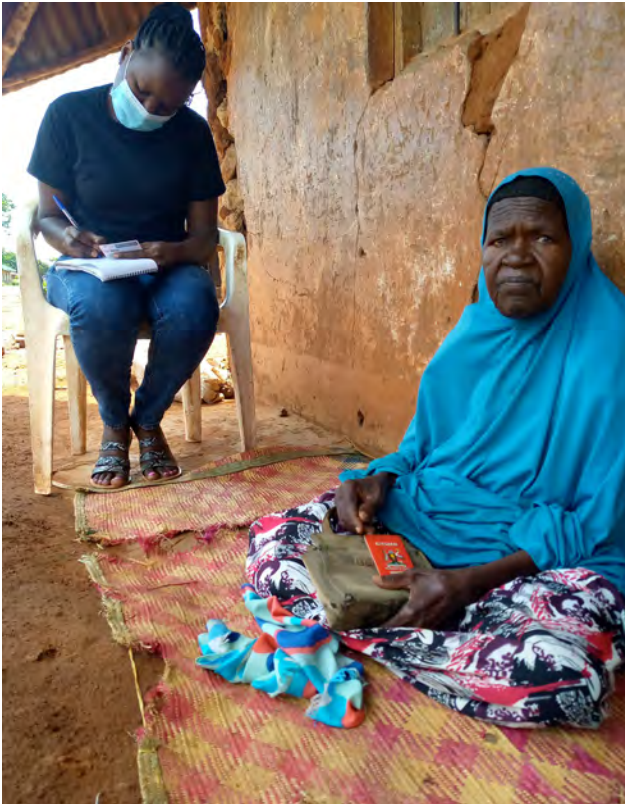
Figure 2. An individual interview in Busia.

other words, this is a good place to test for ‘impact’.