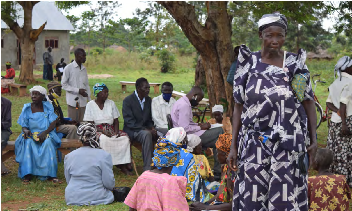
Figure 13. Local government official, seated centre, validating the details of people who claim that errors on their National IDs are preventing them from accessing the SCG.

excluded from receiving the SCG cash transfer. No other targeting mechanisms, such as community meetings, are used to supplement or correct the NIRA data. During our research, we witnessed the process of data validation currently being undertaken by the local government officials and the PMU to determine the scope of the problem; according to senior sources, as many as 40,000 persons over the age of 80 have errors on their NIC and in the NIR and as many as 10,000 did not have IDs at all. This is about one quarter of all persons over the age of 80 in Uganda, according to UBOS projections, and likely still an undercount of the full extent of the problem.