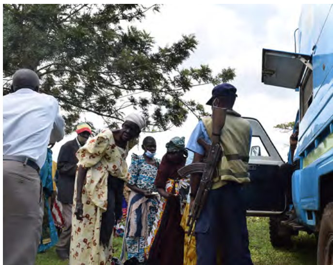
Figure 16 Elderly gather at the PostBank distribution van in Namayingo.

the payment service provider who will be issuing the actual cash. There have been three different payment providers responsible for distributing the SCG. In the first phase, payments were provided by mobile telecom company, MTN, using its mobile money service. 107 In 2015, a new payment provider contract was awarded to PostBank. 108 Postbank is a public bank under the authority of the government of Uganda and uses vans as mobile payment points for SAGE beneficiaries. In 2020, a third party, Centenary Bank, won the bid to provide the SCG payments after the end