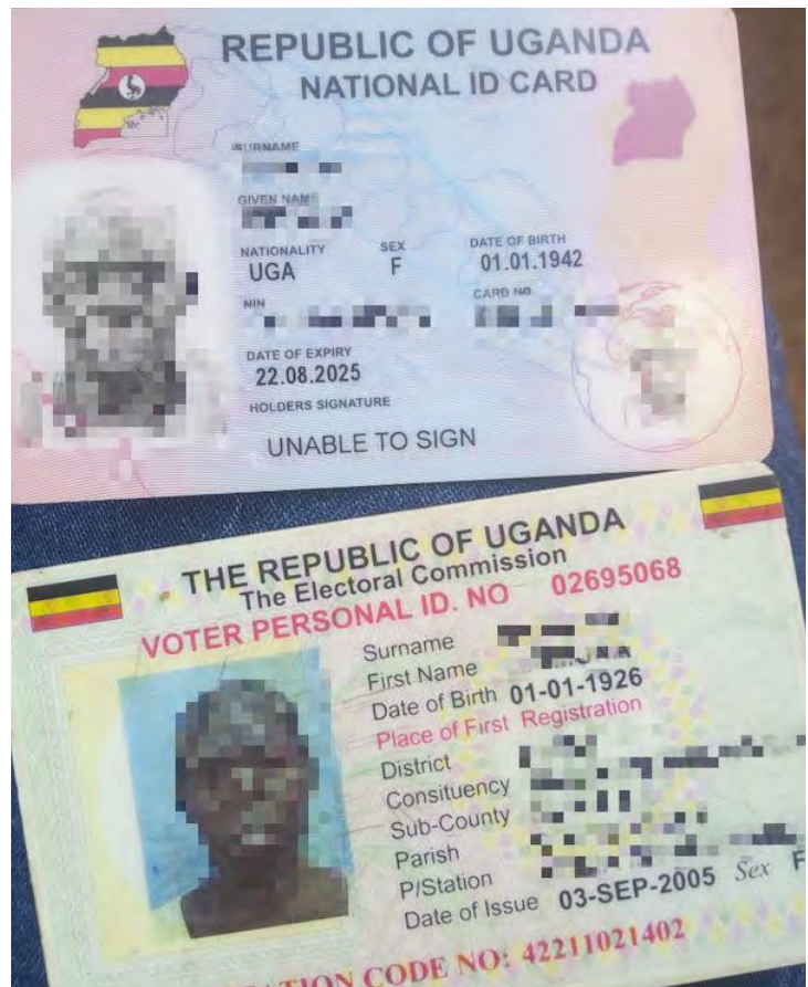
Figure 6. An example of a National ID and Voter's ID for the same person, showing different birth dates.