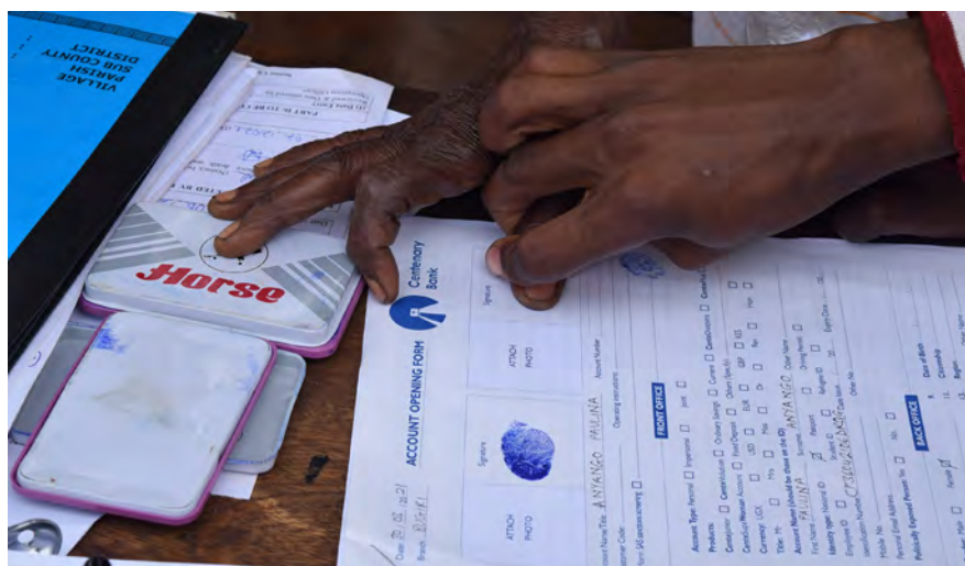
Figure 18. Fingerprints being captured.

enrolment forms. Whereas previously only the yellow slip with the NIN written on it was necessary to collect the payment from PostBank, now beneficiaries needed to once again produce their NIC or they would not be registered for the new account. Given the circumstances, it is unlikely that beneficiaries fully understood or consented to the capture of their personal information, including biometrics, or understood their bank account and relationship with this new, commercial bank.