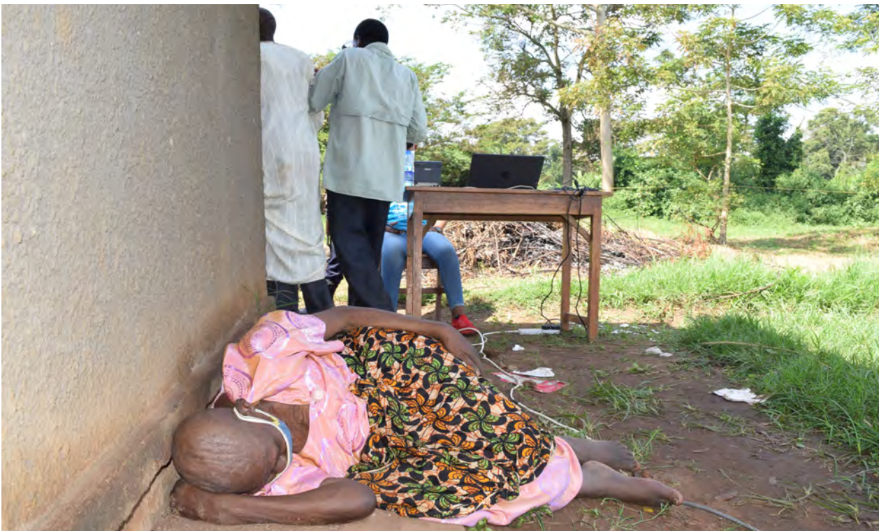
Figure 11. An older person lies in wait for the Post Bank Verification team to resume work.

Poverty among older persons is extremely high, with 80% of older persons in Uganda living in households earning less than double the international extreme poverty line of $3.80 per day 94 and 96% of older persons living on less than $10 per day. This level of poverty leads to other deprivations, as older persons are often unable to maintain adequate levels of housing, sanitation, and clean drinking water. Approximately one in five older persons have a severe disability and suffer from mobility challenges, while diseases such as HIV/AIDS have been difficult to treat within the group due to stigmatization and