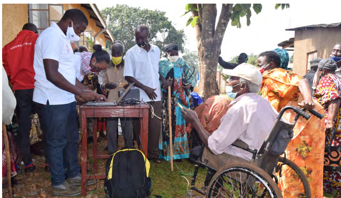
Figure 9. Beneficiaries wait at a SCG distribution point in Kayunga.

But the project has not been without challenges. The SCG has infrequent distribution days that require beneficiaries to travel to a central point to cash out their payments from the payment service provider. 85 This means that beneficiaries often go for many months without receiving any grants and are forced to travel long distances to receive payments. 86 One beneficiary described the process to us: