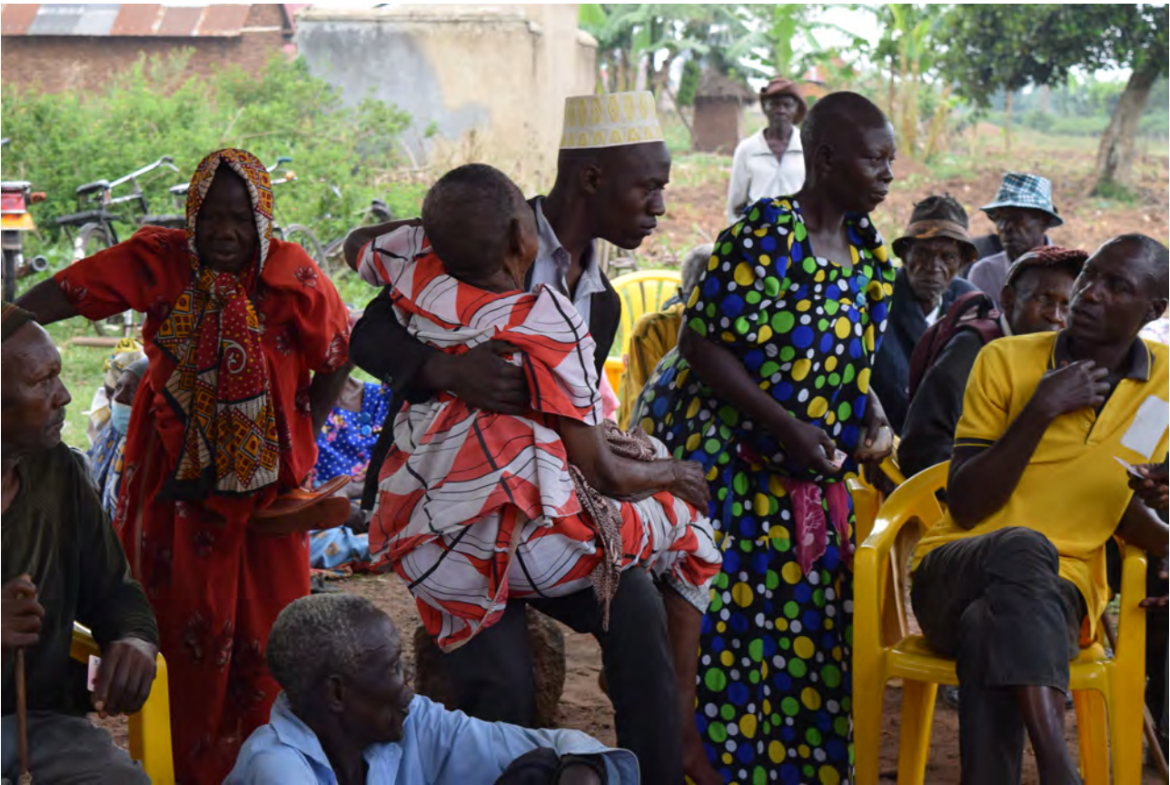
Figure 12. A woman being carried to the SCG distribution point in Namayingo.

benefit available to everyone above 80 years of age (except for former civil servants who already receive a state pension), this still leaves the issue of identifying whether someone is over 80.