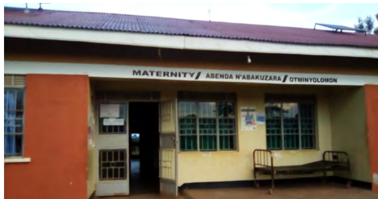
Figure 23. Maternity Wing of Biiso Health Centre where its mandatory for expectant mothers to carry a national ID.

It’s going to make life harder for those who don’t have a national ID. They are going to get health complications including becoming anaemic like the case for young adolescent young mothers who don’t have these national IDs.