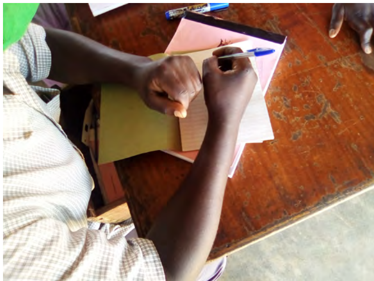
Figure 19. A medical officer during the registration of details of a patient in Namayingo.

Approximately 71% of the health workers in public health facilities and hospitals that we surveyed between November 2020 and May 2021 said that a national ID was required. 113 Meanwhile, only 30% of the workers in private health facilities we surveyed said they required a national ID. 114 When asked when this requirement was introduced in specific health centres answers ranged from October of 2019 to early 2020. What was also made clear by our respondents is that the new,