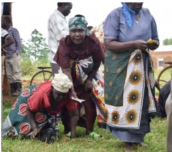
Figure 15. Older persons trying to move around the payment point in Namayingo.

Participating in the SCG cash transfer programme now requires a triple registration process: first, registration with NIRA for a national ID; second, registration and enrolment with the ESP for the SCG-programme itself; and third, registration with