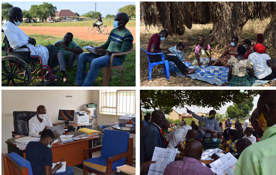
Figure 1. Photos clockwise from top left: 1. An individual interview in Buliisa, 2. A focus group discussion in Nebbi, 3. An interview with a community development officer in Nebbi. 4. An ISER researcher, seated centre, observes the verification and enrolment process for the SCG in Namayingo.

In 2020, the World Bank's Identification for Development (ID4D) initiative wrote in its annual report that: