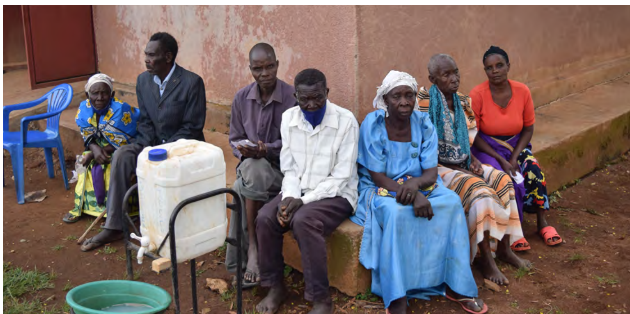
Figure 4 Disgruntled older people in Namayingo who have been unable to register or have errors on their National IDs.

In Busia, we visited the home of a woman who recounted some of the difficulties her family faced trying to obtain a Ndaga Muntu for her 95-year-old mother. As her mother lay in the bed beside her, she told us how her mother had been sick and unable to attend the registration exercise. As a result, her mother was not able to obtain her NIC and was cut off from social assistance programmes. Mass registration for Ndaga Muntu began with an enrolment drive that started in 2014, 66 when many were encouraged by their Local Council