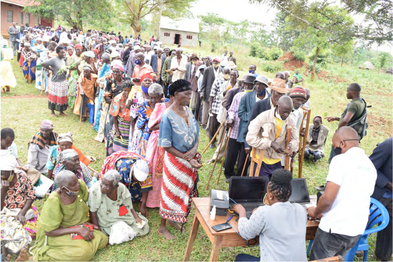
Figure 8. SCG Beneficiaries waiting to validate their identity in Namayingo.

They asked me many questions, the GISO [Gombolola Internal Security Officer] who was supposed to sign for us all was serving many people and without his signature, I could not get the National ID—and he was very hard to find. I am illiterate and old, I travelled on a boda boda and incurred a cost of 4,000 UGX [Uganda shillings] to travel to and from the place of registration. 77