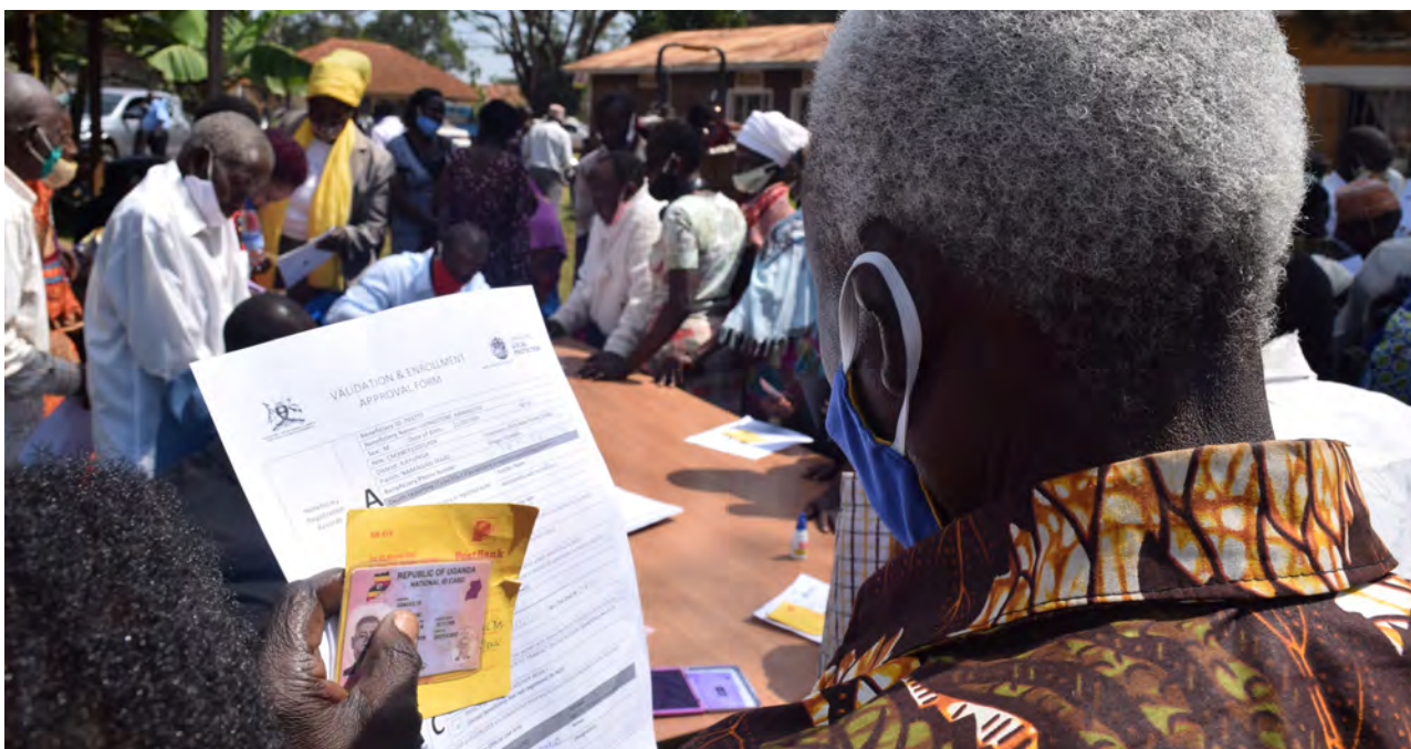
Figure 3. An older man holds his Ndaga Muntu and paperwork at a distribution point for the Senior Citizens' Grant in Kayunga.

Has Ndaga Muntu fostered greater inclusion for poor and marginalized people in Uganda? More specifically, has the national ID system improved access to the human right to health for women and the human right to social security for older persons, especially those living in poverty? This is the central question that we set out to answer in this report. We therefore focused our research in Uganda on the experience of (pregnant) women and older persons living in poverty and marginalization.