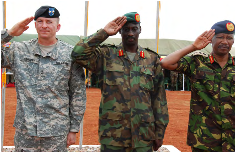
Figure 25. General Aronda Nyakairima, centre, a decorated leader of the UPDF.

joined the National Resistance Army (NRA) in 1982. He fought in the Ugandan Bush War, eventually becoming commander of the Uganda People's Defence Force (UPDF). Under Uganda's hybrid system, General Aronda also held a seat in Parliament from 1996 as a representative of the UPDF.