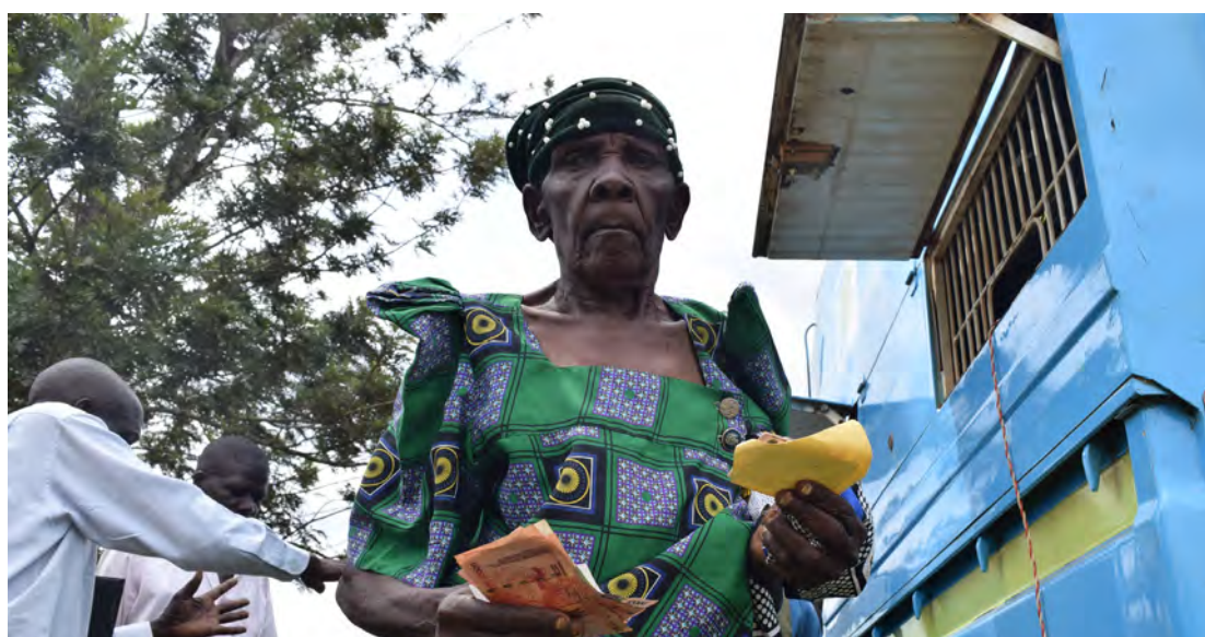
Figure 10. An older person with her SCG.

Approximately 3.7% of the Ugandan population, or 1.59 million people, fall into the category of 'older persons' (meaning over the age of 60), 88 and they will continue to be a minority among Uganda's young population for the foreseeable future. 89 However, in absolute numbers the population of older persons is projected to more than triple to rise