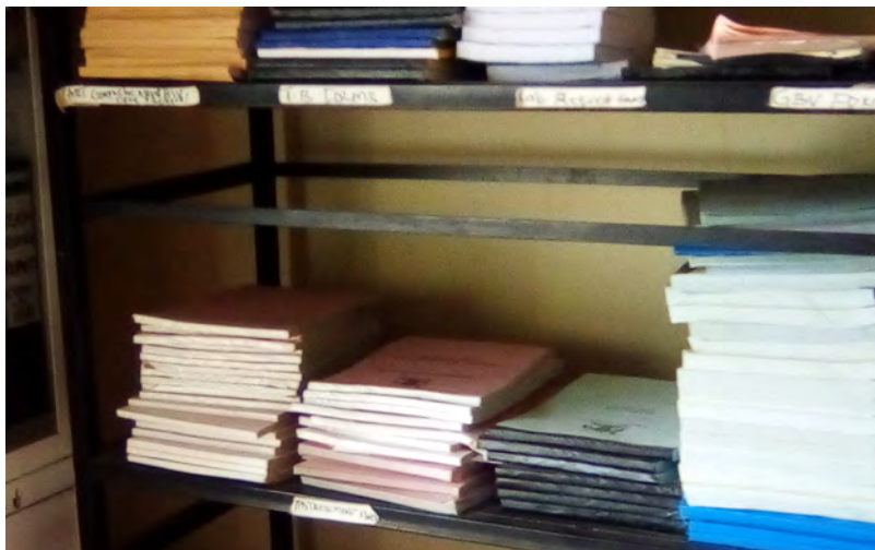
Figure 22. A records office in Buliisa.

The best services, it was felt by many, were private services. One person stated the problem bluntly, "If you have no money here, you die."