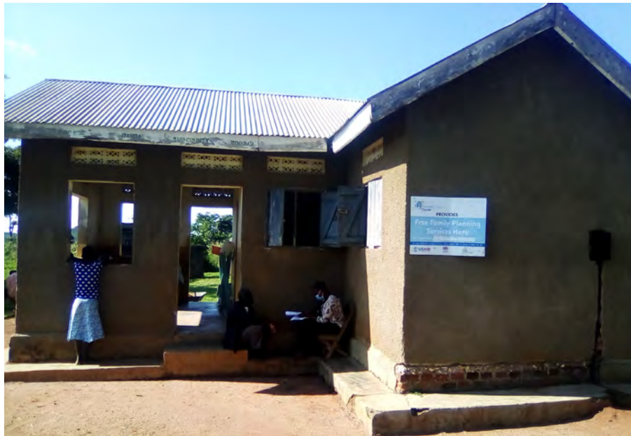
Figure 21. Bujwanga Health Centre in Namayingo where an national ID card is mandated to access health care.