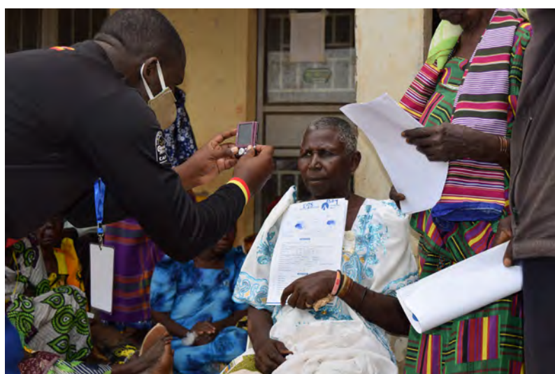
Figure 17. A beneficiary being registered with Centenary Bank.

Since Centenary Bank needed to set up new bank accounts for each older person receiving cash transfers, the transition day required all beneficiaries to also present their national ID card, provide personal information to a Centenary Bank official, have their biographic details captured on a tablet, and have their photo captured. Fingerprints are recorded directly onto the