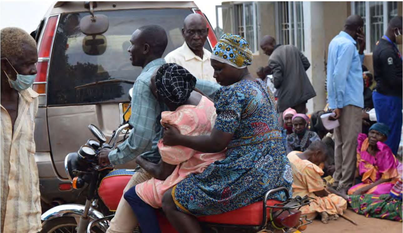
Figure 5. An older person riding on a boda boda motorcycle taxi, the primary means of transportation for many Ugandans.

district, abandoning her farming for several days and paying to travel back and forth by boda boda . For comparison, the average monthly income of a rural youth was 172,000 UGX or $48.5 USD.